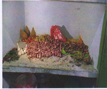
SAMPLE FOOD ITEM